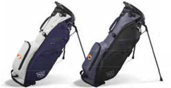
Classic Navy | Cream