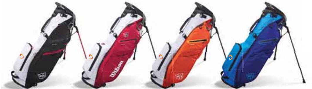
Dynapower Black | White | Red